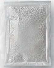
CARGOSORB: Bag of granules before and after exposure to moisture